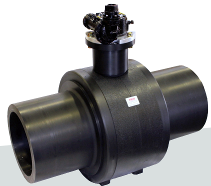
16" valve with gear operator

For additional information visit www.broen.us or check the dedicated product brochure